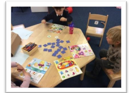
I can follow rules and take turns