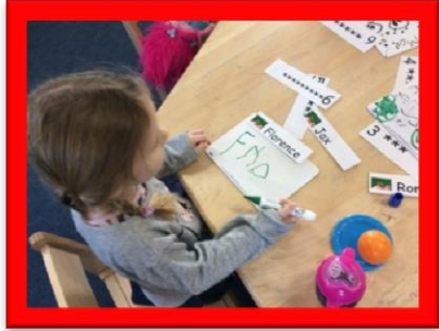
I have the right to learn