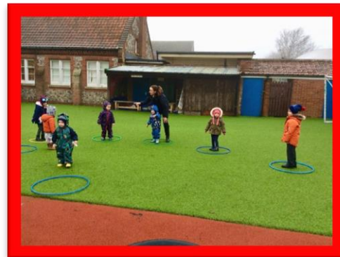
We respect each other's differences and realise we are all special