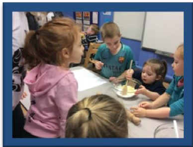
My older friends support me. We collaborate