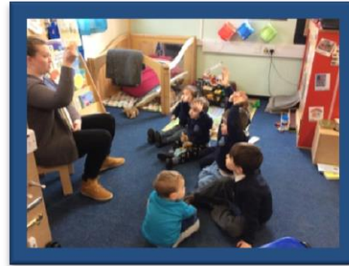
I have a right to have my opinions heard