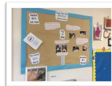
We learn about other country's festivals and celebrations