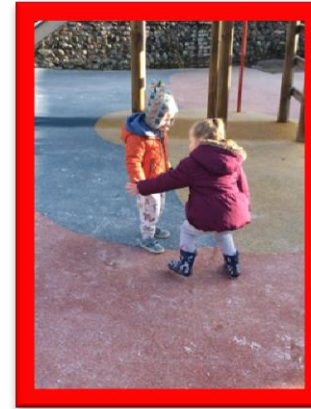
We are kind to each other and helpful